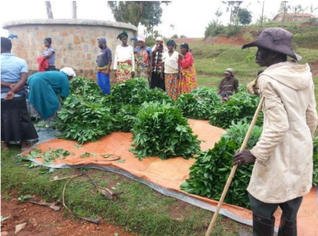
Farmers delivering cassava leaves