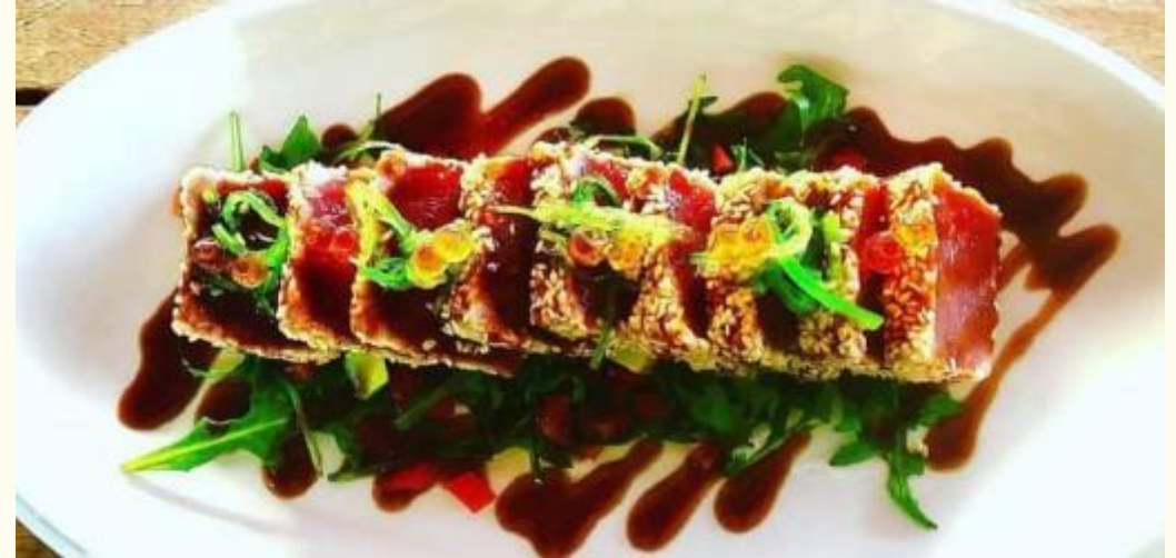
Tuna dish prepared by a local customer