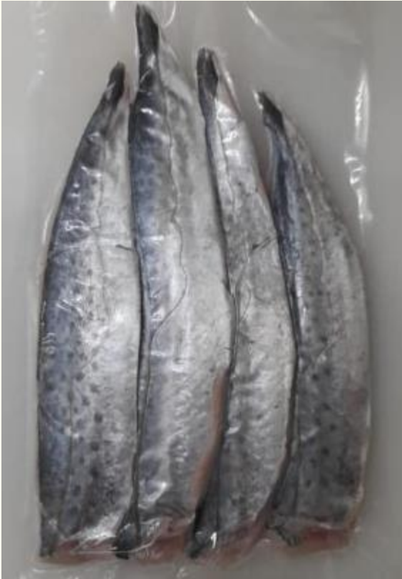
Kingfish filet with skin