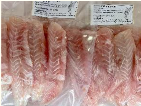
Butterfish with/without skin