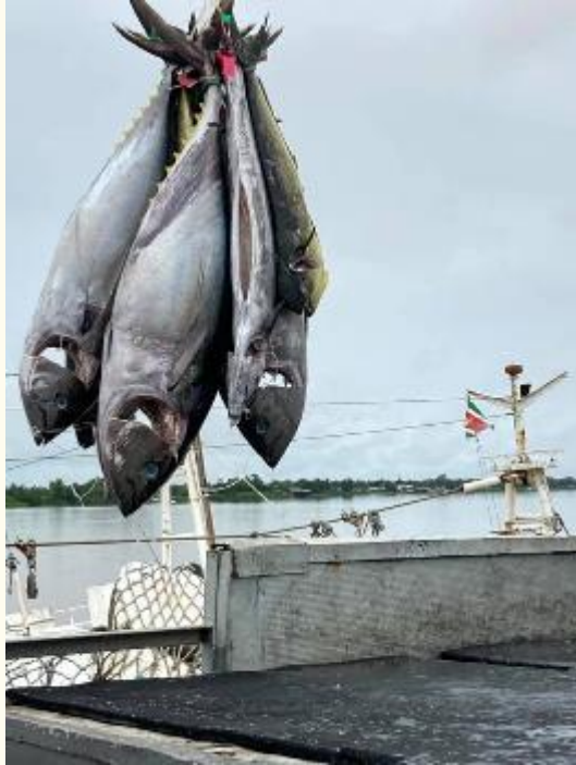
Offloading the catch of the day